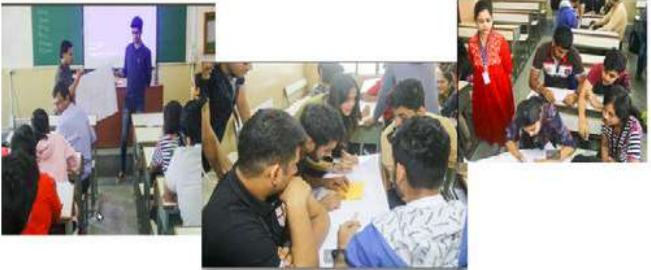
A Design Thinking Workshop was held for the Third Year Students on 7th January, 2019