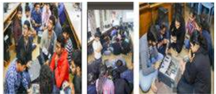
PC Assembly Workshop

To quench the thirst of young curious minds as to what is inside the computer and how does it function and to inculcate some more curiosity to touch deeper waters of thoughts and understanding, a 'PC Assembly Workshop' was held on 8th January 2019. This was a workshop, wherein some detailed insight was given about the CPU. It explored most of the internal parts of the CPU. It was basically a hands-on session which helped improve and strengthen practical knowledge of students, not forgetting that theory about various components were also looked onto. 61 SE students in total were let into the beautiful world of hardware through this workshop.