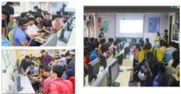
The Arduino Workshop

An Arduino Workshop was organized on 11 January, 2019 for the second year students of the department. This workshop was conducted by a team of Third year computer engineering students. The workshop aimed at enhancing the knowledge of the SE students with the knowledge of Arduino and getting them equipped for their mini project of the semester. The students were divided into smaller groups and were given hands-on practice. A total of 60 SE comps students were imparted with the knowledge of arduino.