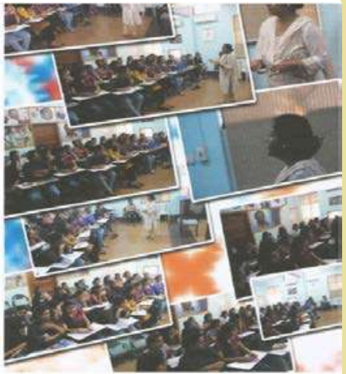
The Counselling Session